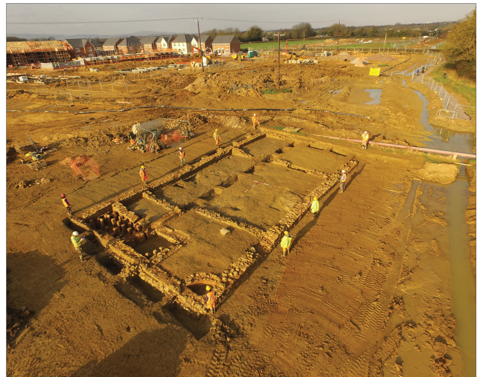
Millfields, Cam Villa (Gloucestershire) (above). A small rural villa, located within a wider Roman field system, excavated by TVAS South West in 2019. Apart from two ovens no outbuildings were found. It may be that this villa stood alone or any other buildings lie outside of the excavation area. High status features included a hypocaust, stone furniture and painted wall plaster.