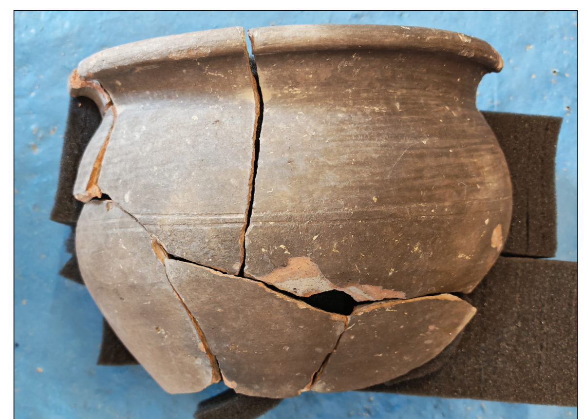
Right: A nearly complete ceramic vessel, probably of Late Iron Age date