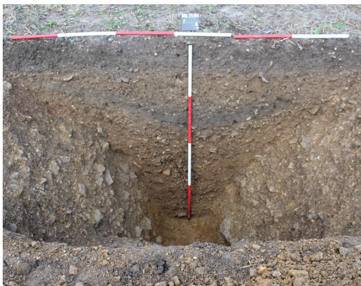
Above: Hand dug slot across a 'V' shaped ditch, 2m deep

To carry out archaeological excavations the area first has its topsoil and subsoil removed by machine under the supervision of an archaeologist. This revealed the natural geology into which archaeological features are cut and therefore visible. Each feature is then individually investigated by archaeologists using hand tools only. Each individual slot is then drawn, photographed and described. All finds are recovered for analysis by specialists after the excavation is complete.