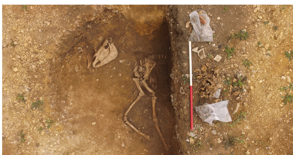
Above: Excavation of the Roman villa. Right: The start of excavation on the Roman villa. Left: Partially excavated Roman horse remains.

Multiple very large pits dating to the Iron Age and Roman periods are present across the site likely used for the storage of grain or to protect seeds for the following year.