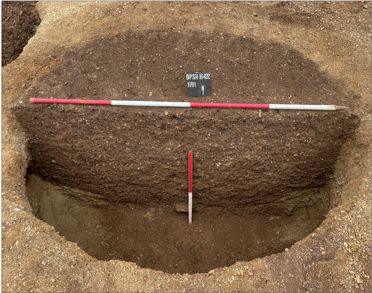
Iron Age storage pit. Vertical scale- 1m, Horizontal scale- 2m

An Iron Age storage pit excavated at this site. When grain is placed in these pits and sealed, the accumulation of carbon dioxide given off by initial germination of the grain around the pit sides halts further germination and kills off insects. This, combined with the low temperatures of underground storage is an efficient way of storing grain.