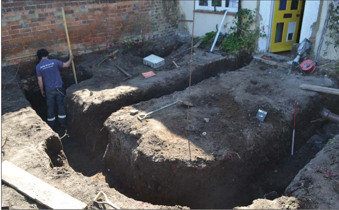
Plate 1. Extension footings after excavation, looking south west, Scale: 1m.