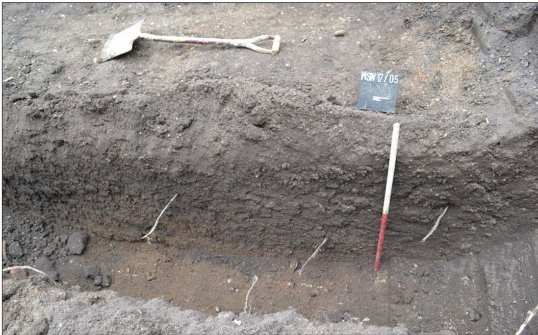
Plate 2. Representative section, looking east, Scale: 1m.