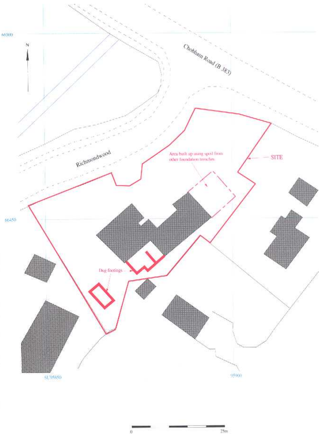
Figure 3. Location of areas observed during watching brief.