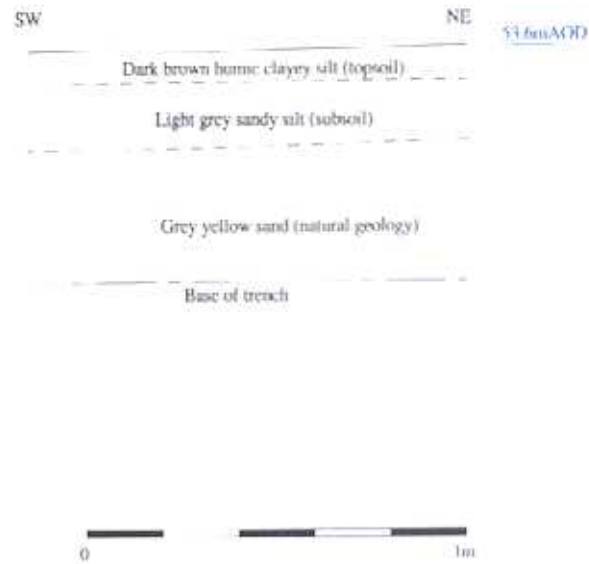
Figure 4 Representative Section