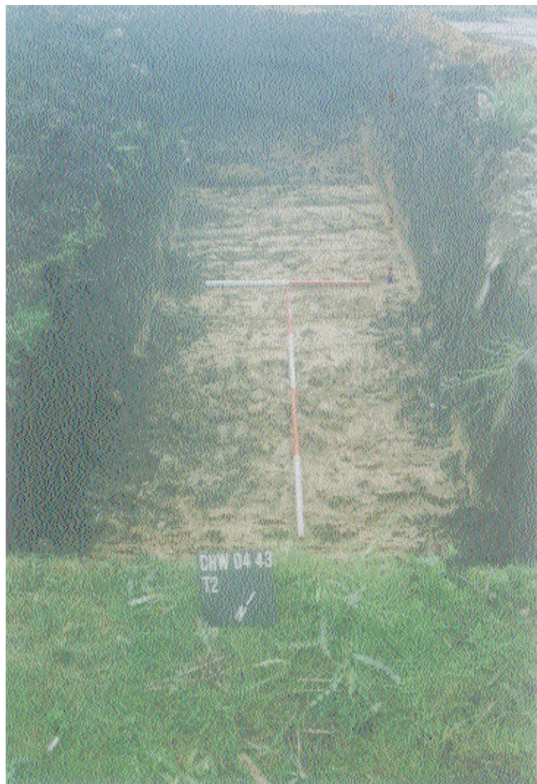
Plate 2. Trench 2 looking south east, scales: 1m and 2m.