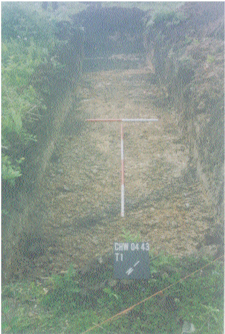
Plate 1. Trench 1 looking south east, scales: 1m and 2m.