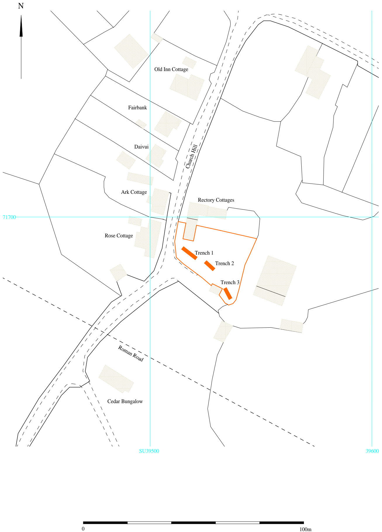
Figure 2: Location of Trenches