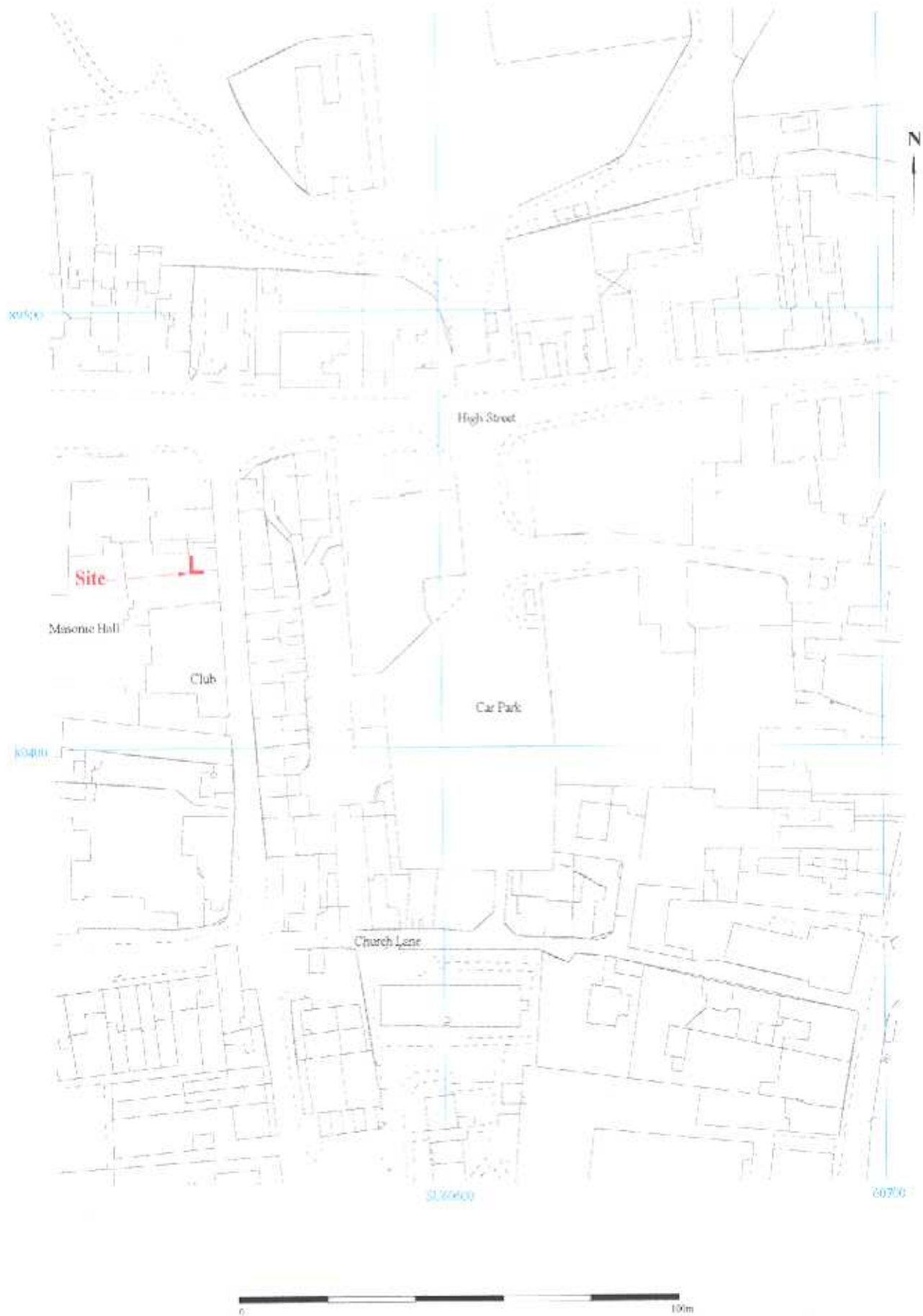
Figure 2. Location of watching brief.